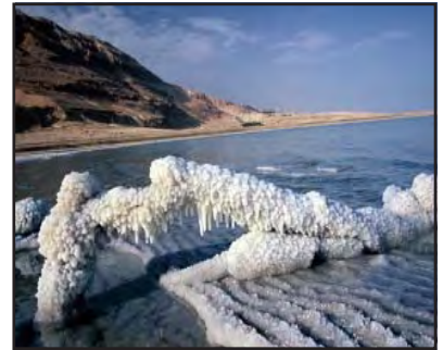
The Dead Sea